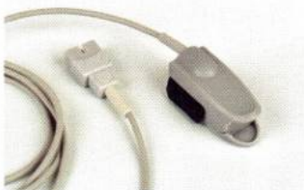
SpO 2 Sensor