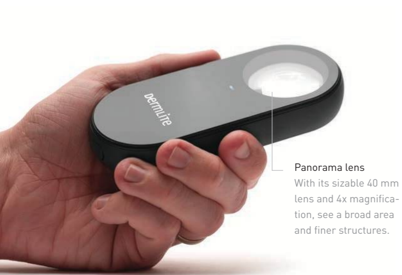
Panorama lens With its sizable 40 mm lens and 4x magnification, see a broad area and finer structures.