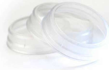
IceCap® Disposable snap-on infection control