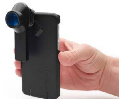
DL1 & iPhone