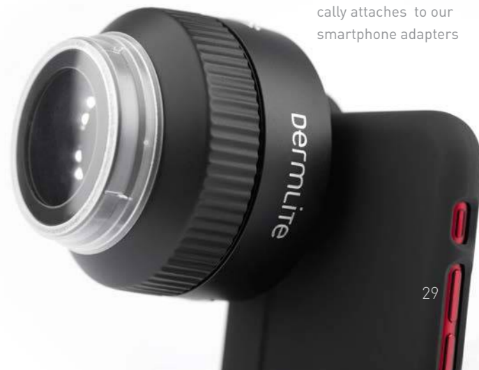
Foto X magnetically attaches to our smartphone adapters