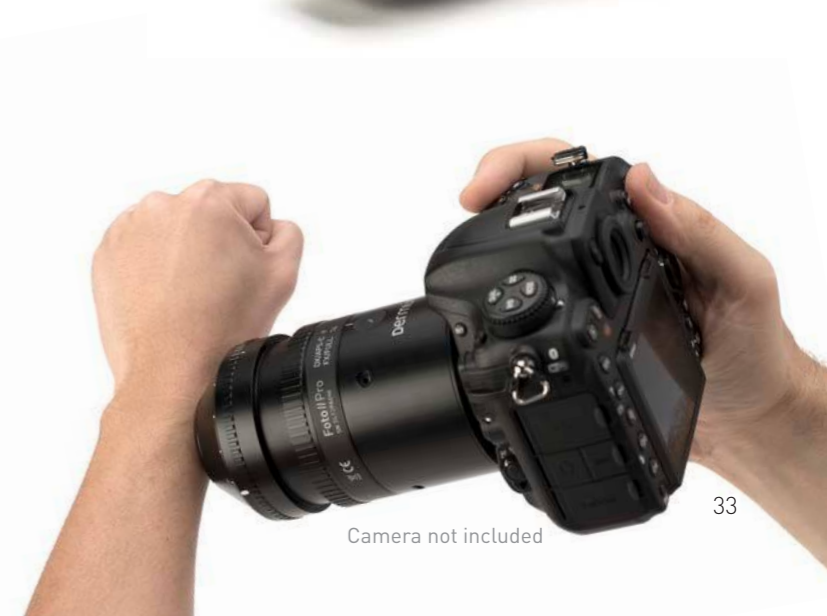
Camera not included