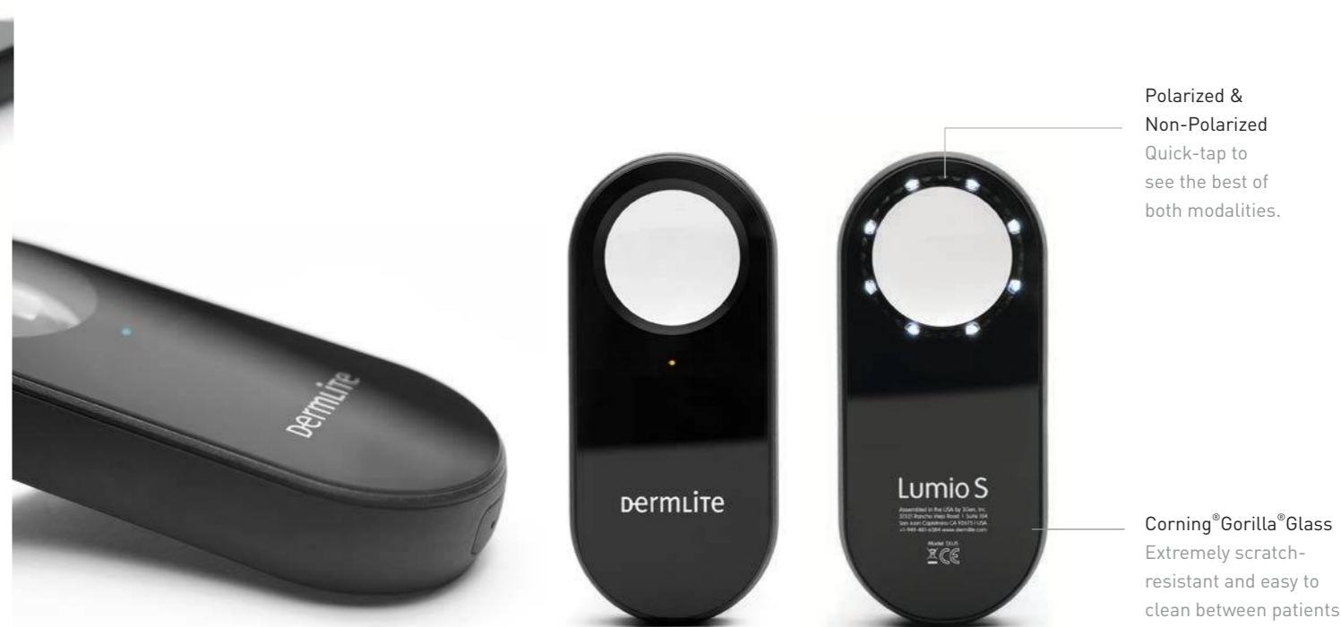
Polarized & Non-Polarized Quick-tap to see the best of both modalities.

structures invisible to the naked eye. Simply tap & hold to turn on the device, quick-tap to change between two sets of polarized and non-polarized LEDs. The minimalist design of Lumio S is even more functional than simply cool. A clean, elegant exterior with only a single USB jack is much easier to keep