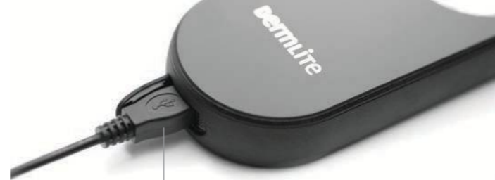
USB convenience Compatible with your smartphone charger, your PC or any USB jack; no custom charger needed.