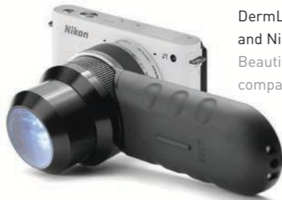
DermLite DL3N and Nikon 1 Beautiful images in a compact package

The quickest way to use DermLite with your smartphone or iPad. Sold separately.