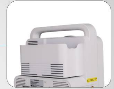
Accessory box for standard configurations