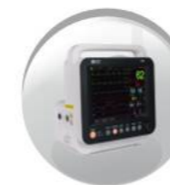
Bed to bed view via central monitor station