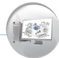
HL7 protocol to connect hospital system