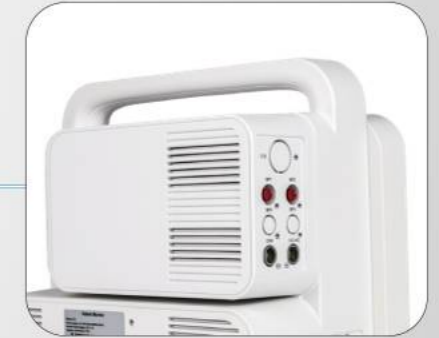
Parameter case with optional parameters