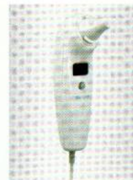
Infrared ear probe