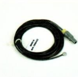
Skin temp probe